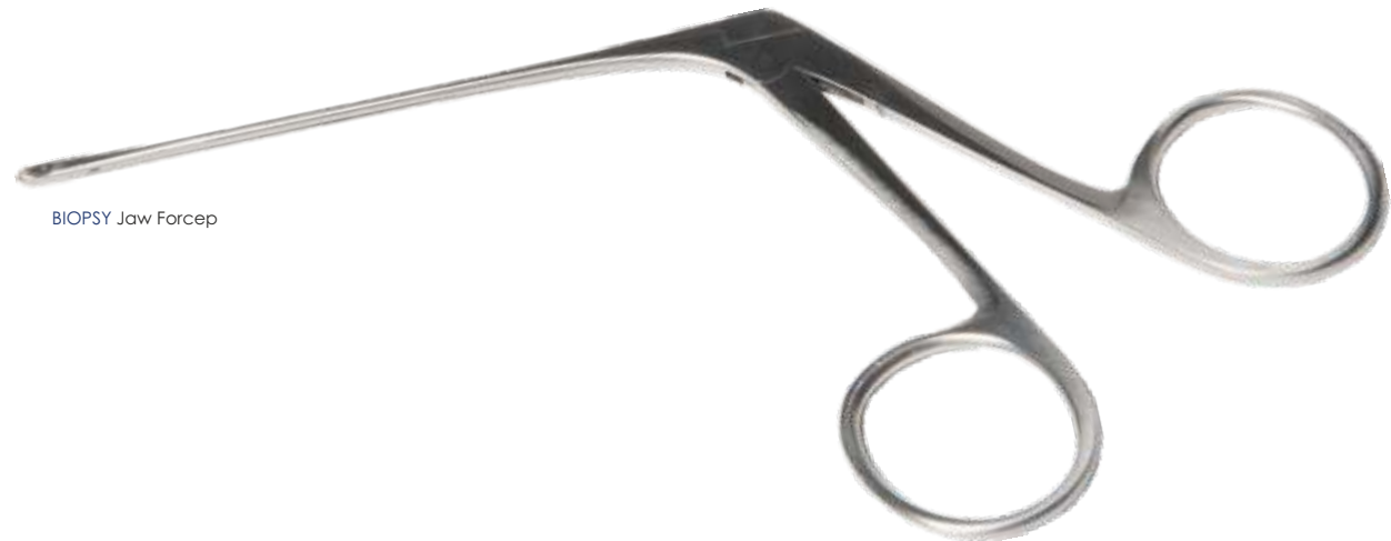
BIOPSY Jaw Forcep