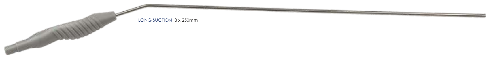
LONG SUCTION 3 x 250mm