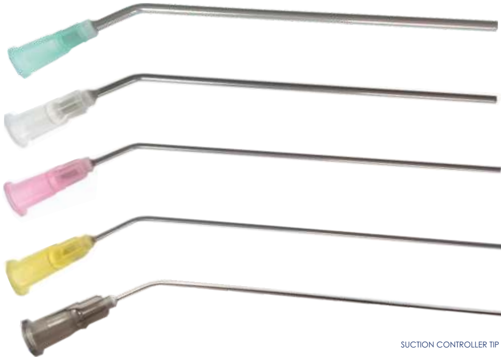
SUCTION CONTROLLER TIP